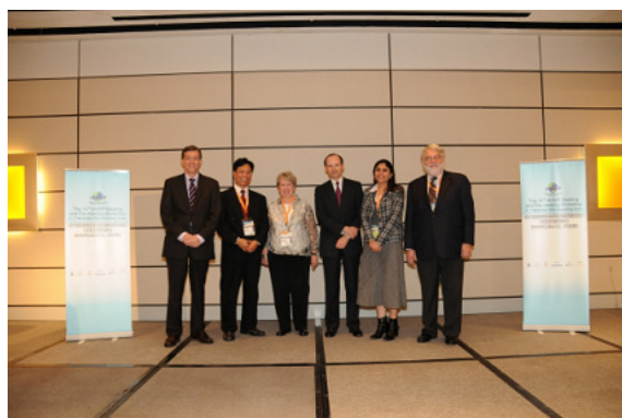
Speakers & moderators for the 14th AHWP Pre-meeting Workshop