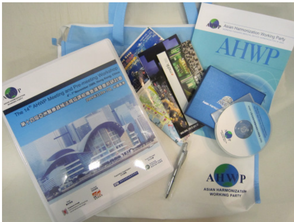
Figure 1 Document Bag of AHWP Meeting

HKPC was responsible for preparing the meeting documentations and materials, including the collection, proof-reading, editing and printing of meeting documents, design and production of meeting bags, liaison with State Food and Drug Administration for production of the "Collection of Medical Device Regulation from AHWP Main Member Economies (2009)" VCD, liaison with Medtronic Inc for the souvenirs and liaison with the Hong Kong Tourism Board (HKTb) for Hong Kong Map and stationery.