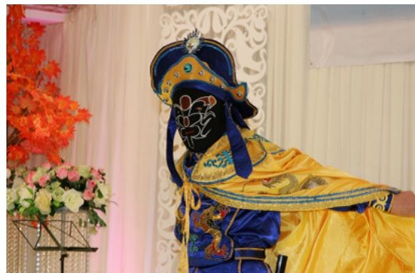
Cultural performance during Gala Dinner