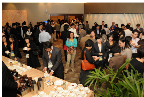
Participants were sharing their experience during the tea break of the 14th AHWP Pre-meeting Workshop.