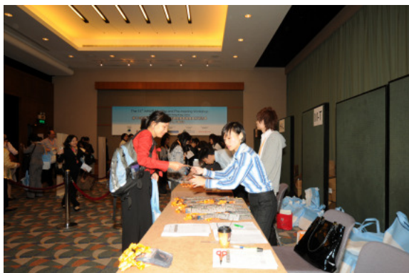
Registration counter on 4 November 2009