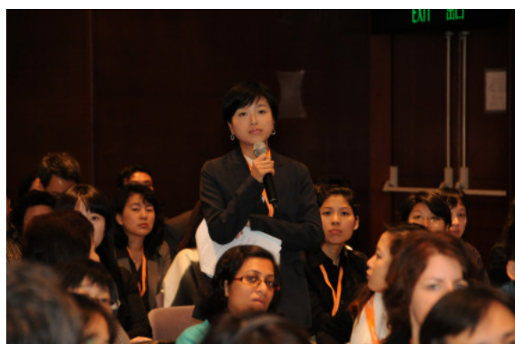
Interactive Q&A session was held during the 14th AHWP Pre-meeting Workshop.