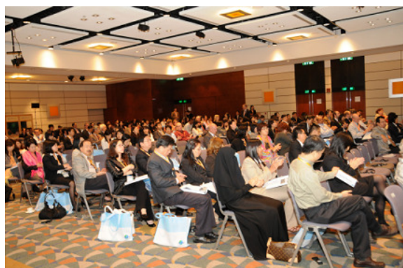
Participants for the 14th AHWP Pre-meeting Workshop