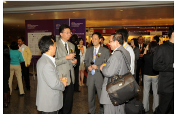
Participants of AHWP cocktail reception