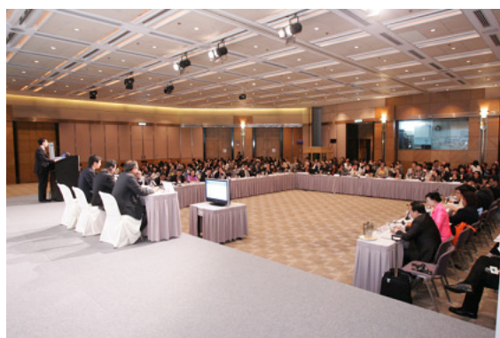
Participants for the 14th AHWP Meeting