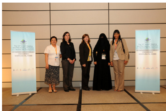
AHWP new comers from Chile, Jordan & Peru