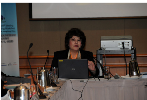
Representative from GMDN Agency was presenting their nomenclature system.