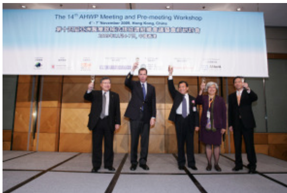
Toasting ceremony for AHWP Luncheon