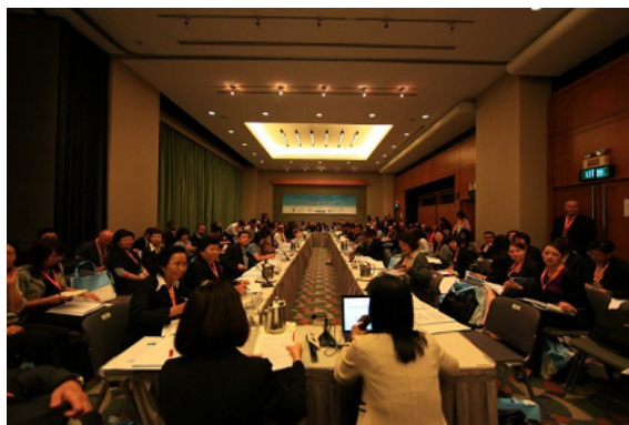
Participants of the 9th AHWP TC Meeting