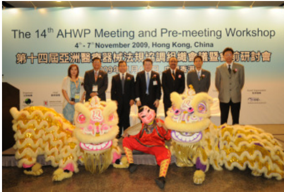
Guests of AHWP cocktail reception