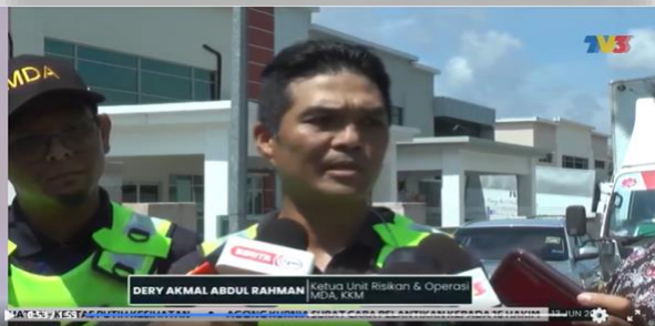
MDA, KKM | Syarikat Jual Peranti Perubatan Tidak Berdaftar Diserbu Sebuah syarikat di Batu Pahat, Johor diserbu Pihak Berkuasa Peranti...