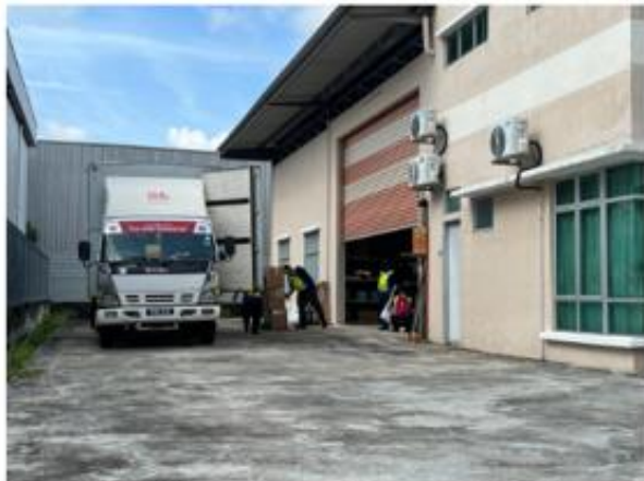
PHIL: Sebuah van diserbu ke atas sebuah pejabat yang mengedarkan peralatan perubatan tidak berdaftar dari 1 unit lesen di Batu Pahat.

View on desktop version: 14 Jul 2021 8:46 pm.