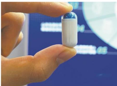
安翰 “消化道振动胶囊系统” “VibraBot” An Alimentary Canal Vibrating Capsule System from Ankon