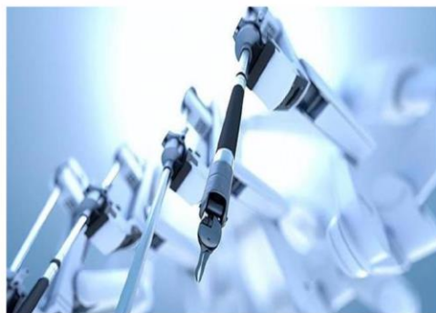
直观复星 “达芬奇”手术机器人 “Da Vinci” Surgical Robot from Intuitive Fosun