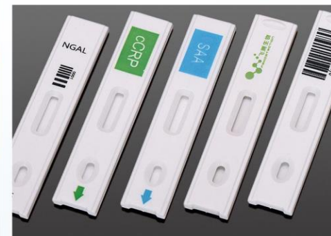
2家医疗机构的自行研制 体外诊断试剂产品 入围国家试点目录

The in vitro diagnostic reagent products developed independently by 2 Pudong's medical institutions have been included in the national pilot catalogue