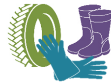
Rubber based products