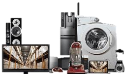
Electrical & Electronics Equipment