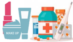
Healthcare products (Cosmetics, Medical Device, Pharmaceutical, Traditional Medicines and Health Supplements)