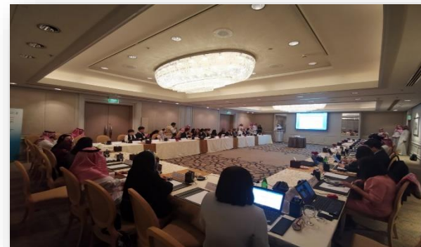
AHWP TC Leaders Meeting in Riyadh, Saudi Arabia, 2019