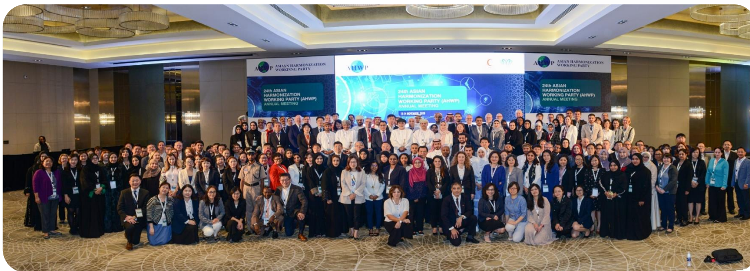
24 th AHWP Annual Meeting in Muscat, Oman, 2019