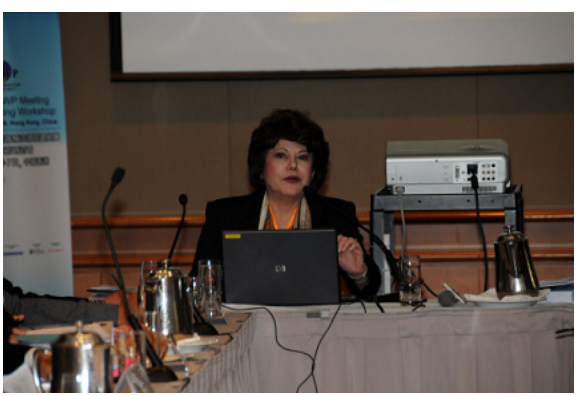
Representative from GMDN Agency was presenting their nomenclature system.