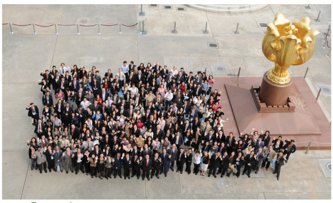
The 14<sup>th</sup> AHWP Meeting and Pre-meeting Workshop (4<sup>th</sup> - 7<sup>th</sup> November 2009, Hong Kong, China) 第十四屆亞洲醫療器械法規協調組織會議暨會前研討會(2009年11月4-7日, 中國香港)

Group photo taken in Golden Bauhinia Square during the Opening Ceremony