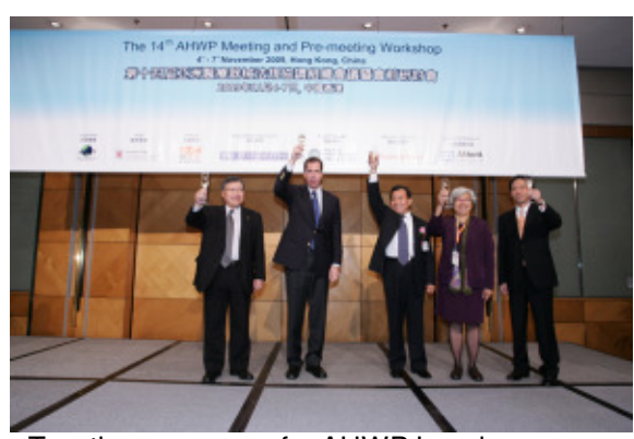
Toasting ceremony for AHWP Luncheon