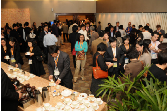
Participants were sharing their experience during the tea break of the 14th AHWP Pre-meeting Workshop.