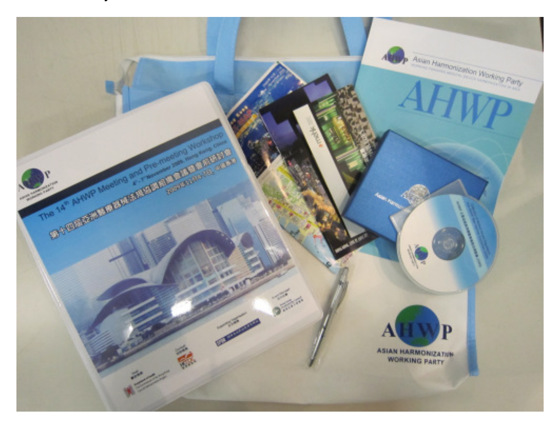
Figure 1 Document Bag of AHWP Meeting

HKPC was responsible for preparing the meeting documentations and materials, including the collection, proof-reading, editing and printing of meeting documents, design and production of meeting bags, liaison with State Food and Drug Administration for production of the "Collection of Medical Device Regulation from AHWP Main Member Economies (2009)" VCD, liaison with Medtronic Inc for the souvenirs and liaison with the Hong Kong Tourism Board (HKTB) for Hong Kong Map and stationery.