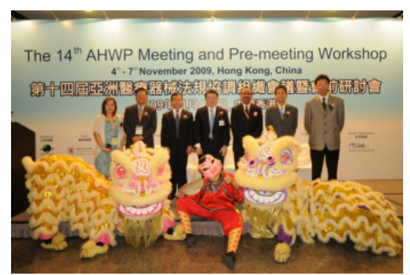
Guests of AHWP cocktail reception