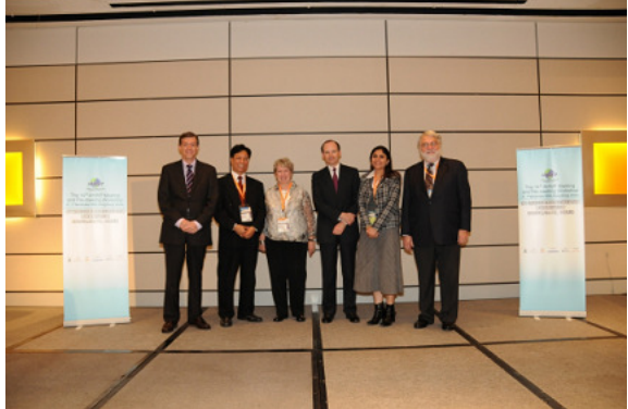
Speakers & moderators for the 14th AHWP Pre-meeting Workshop