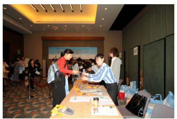
Registration counter on 4 November 2009