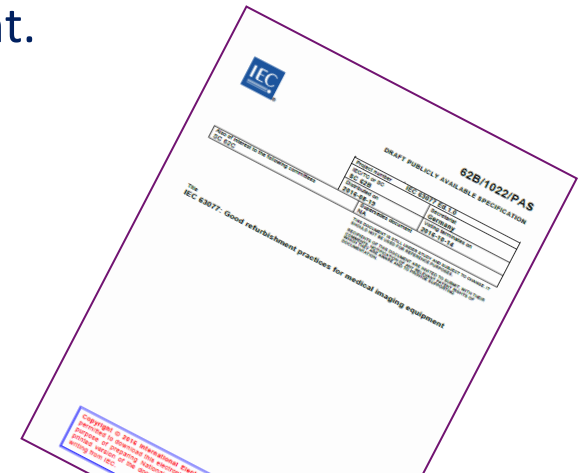
IEC/PAS 63077 Ed. 1