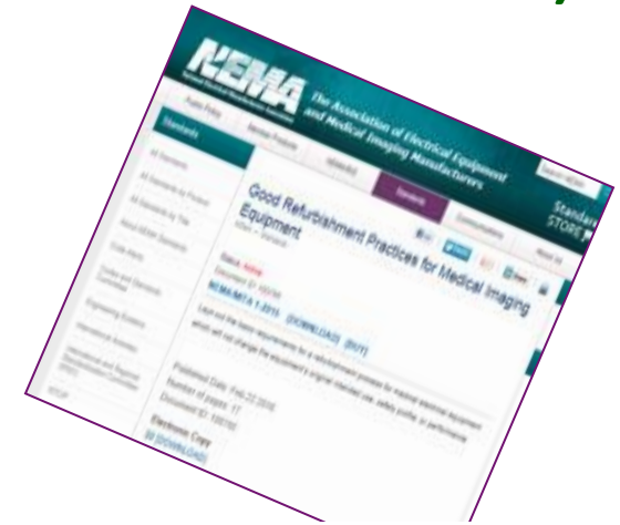
NEMA MITA 1-2015

On going discussions with conformity assessment bodies to optimise the use of such NEMA standard and IEC PAS.